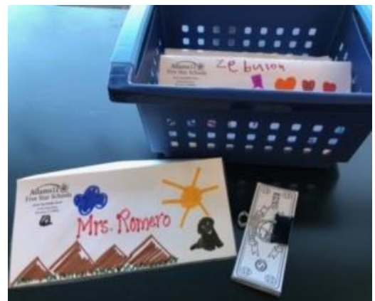
Personal Wallets: Students rate their work and receive a payday! Working toward tickets/snacks for semester party.