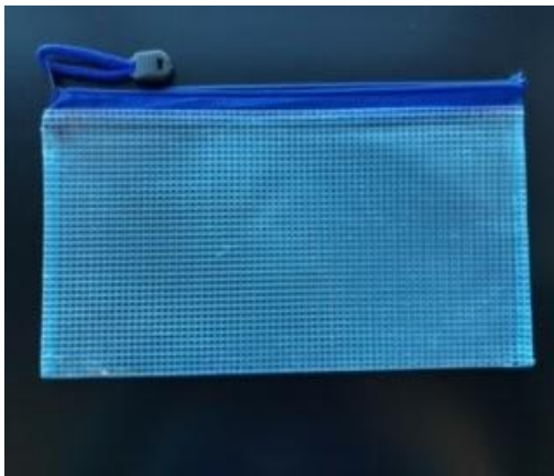
Cash Collection Bags: Used to store money while delivering as well as make change!